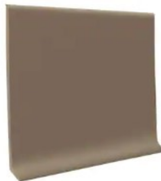
ROPPE Pinnacle Fawn 6 in. x 120 ft. x 1/8 in. Rubber Wall Cove Base Coil