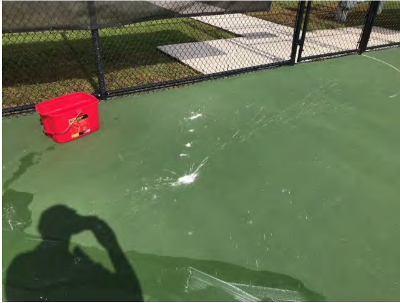
Tennis court (Before)