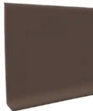
ROPPE Light Brown 4 in. x 120 ft. x 1/8 in. Vinyl Wall Cove Base Coil