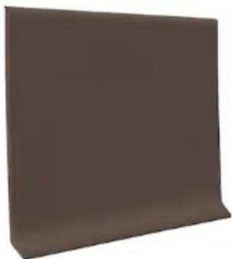
ROPPE Burnt Umber 4 in. x 1/8 in. x 120 ft. Vinyl Wall Cove Base Coil